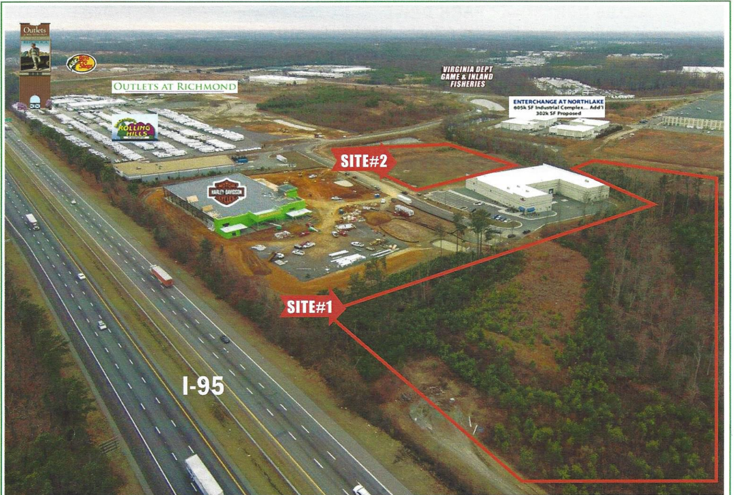
SITE #1 12.0 ACRES

12195 NORTHLAKE PARK DRIVE ASHLAND, VA 23005